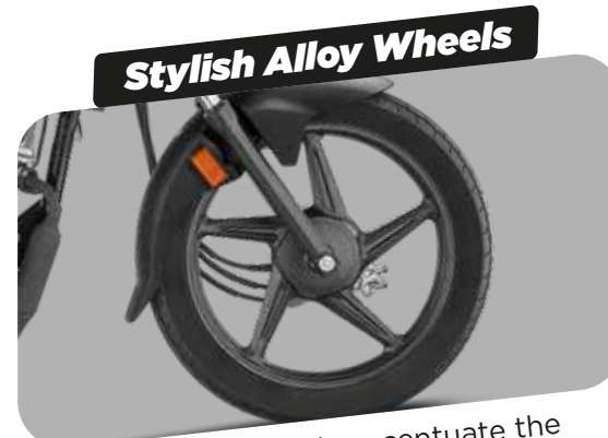
Stylish Alloy Wheels All-black alloy wheels accentuate the overall look of the bike.