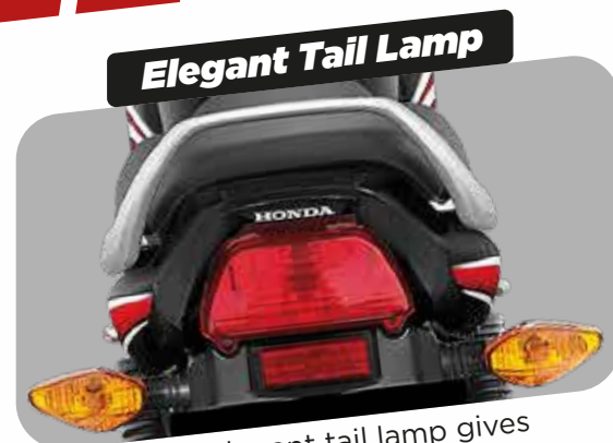
Elegant Tail Lamp Bright and elegant tail lamp gives the bike an imposing look from the back.